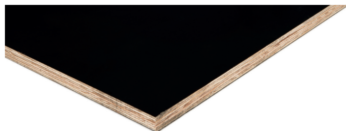
BOTTOM SIDE smooth

Face coated with a brown black phenolic film (400 g/m 2 ), smooth